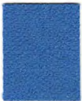
Electric Blue (43)