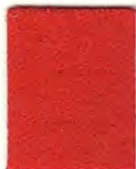
Brite Red (91)