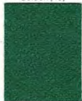
Dark Green (32)