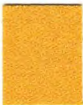
Brite Orange (84)