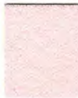
Brite Pink (41)