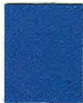
Euro Blue (57)