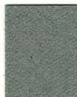
Steel Gray (72)