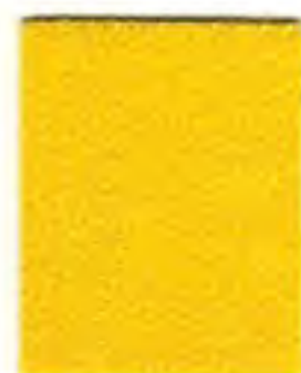
Brite Gold (53)