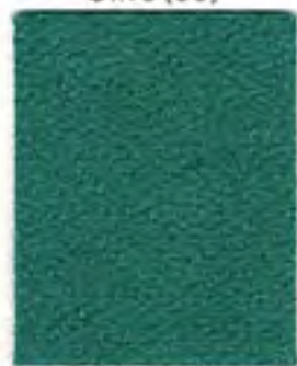
Basic Green (00)