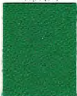
Championship Green (31)