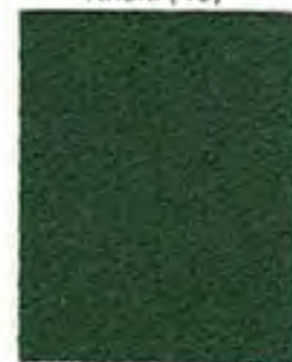
Bottle Green (39)