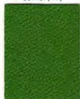
English Green (38)