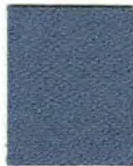
Academy Blue (51)