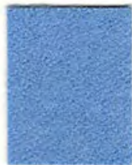
Brite Blue (85)